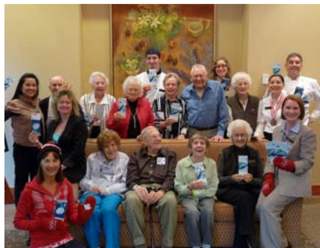
Happy recipients of some Olympic tickets