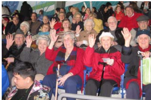
Residents enjoying live Sledge Hockey.

Residents and staff of The Summerhill were full of Olympic spirit during the month of February. They watched the Olympic torch make it's way up Lonsdale Avenue, held their own Olympic hockey shootout, cheered our Canadians to gold together, and wore red and white colors in constant support. Many residents and staff attended both the main Olympic events as well as the Para-Olympic sledge hockey events thanks to tickets generously donated by Pacific Arbour Retirement Communities! It was a truly memorable time for all.