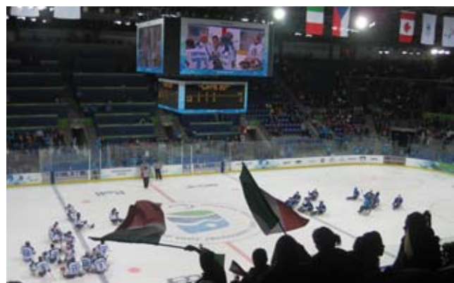
Sledge Hockey Game

Researchers have found that people who eat two or more servings of fish (high in Omega 3 fatty acids) had a lower risk for age related Macular Degeneration.