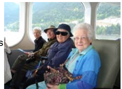
The ferry ride offered up some fabulous water and mountain views.

There is nothing like a day on the water to lift the spirits as residents found out on a recent trip to Gibsons on the sunshine coast. Residents visited the many shops and historical sights then enjoyed lunch at Molly's Reach.