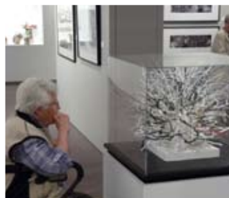
Joan contemplates the artist's work.

"It's not so much about what is being painted, the subject, but rather the painting itself, what it becomes and how each of us is affected by it."